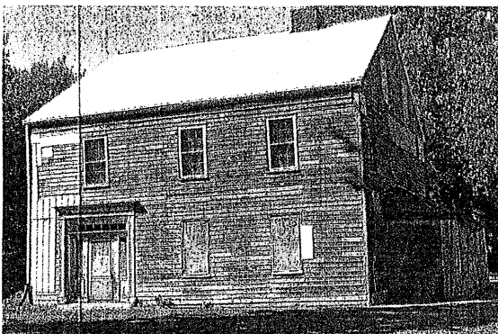
The stagecoach stop, located in West Liberty, was built in 1842 and was put into the National Registry of Historic Places in early 2016. The West Liberty Heritage Foundation is fundraising to purchase the 174 year old building.